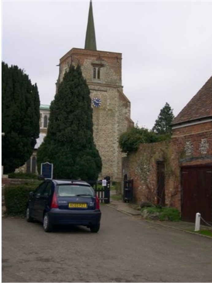
Figure 10: Parish Church of St Leonard, Flamstead, from the High Street