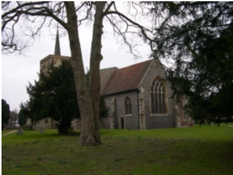
Figure 11: Parish Church of St Leonard, Flamstead, South East Corner.