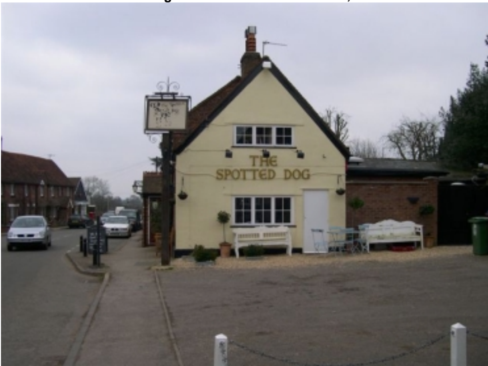
Figure 8: Spotted Dog, Flamstead