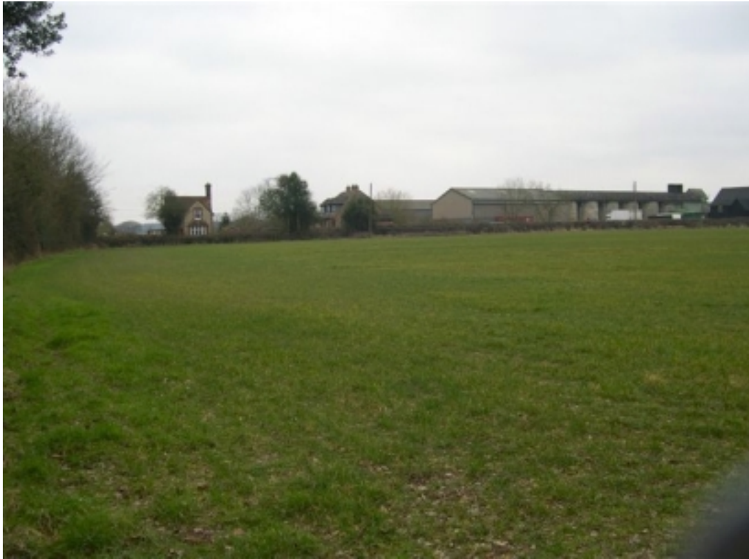
Figure 2: View of farmhouses and buildings from public footpath