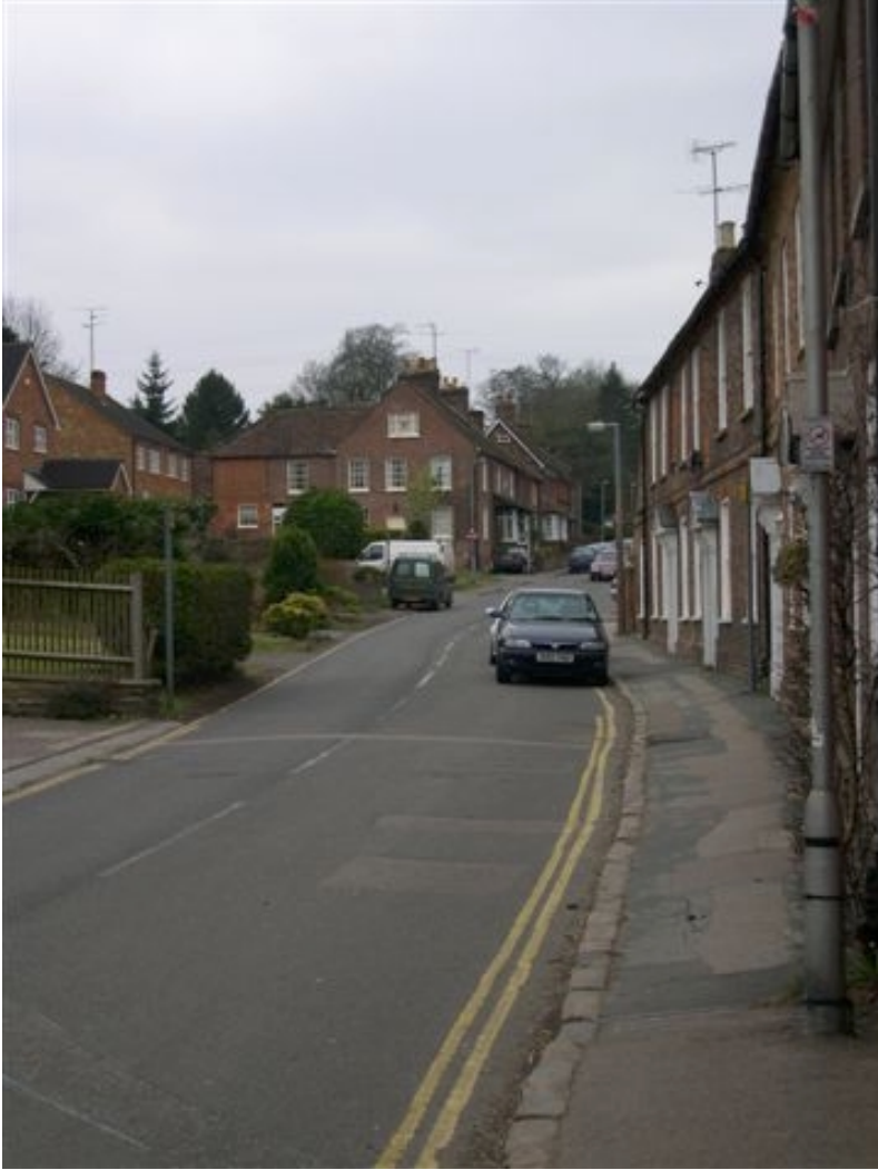
Figure 6: Road leading south towards Roe End farm, from Markyate