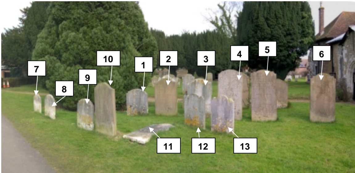
Figure 12: Burchmore Family Graves looking East

A group of gravestones stand together just to the West of the North Door of the church. Some are well preserved, others are difficult to read, but all seem to be Burchmore or close family Graves. The oldest legible inscription is from 1757, the newest from 2000.