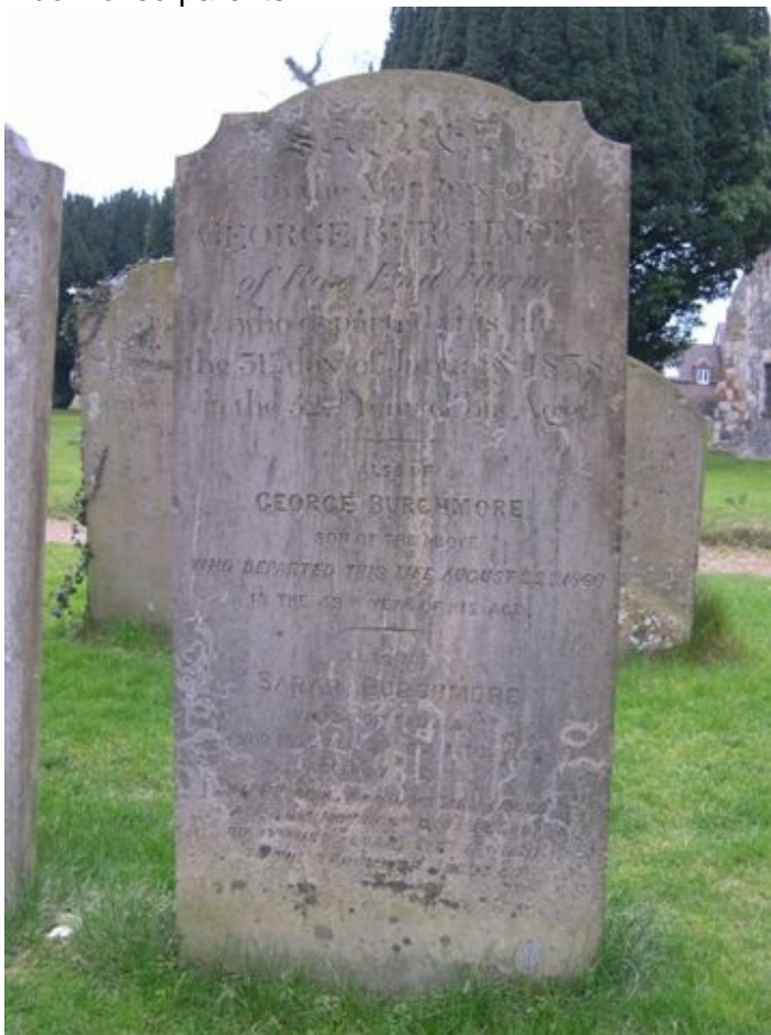
Figure 13: Grave inscription, looking East