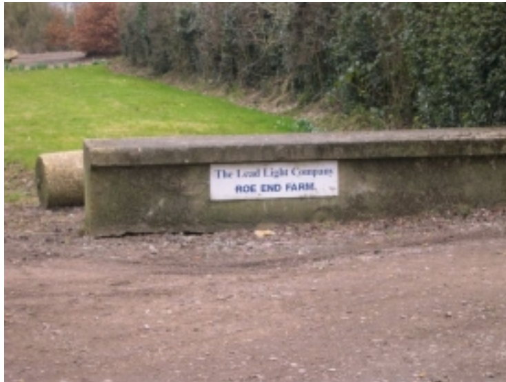
Figure 1: Entrance to Roe End Farm

Roe End lane is a narrow lane which eventually turns into a bridle path. To the north of the lane are Roe End Lodge (a fairly modern building) and Roe End Farm, now a business, with two old houses which seem to be in use as office space.