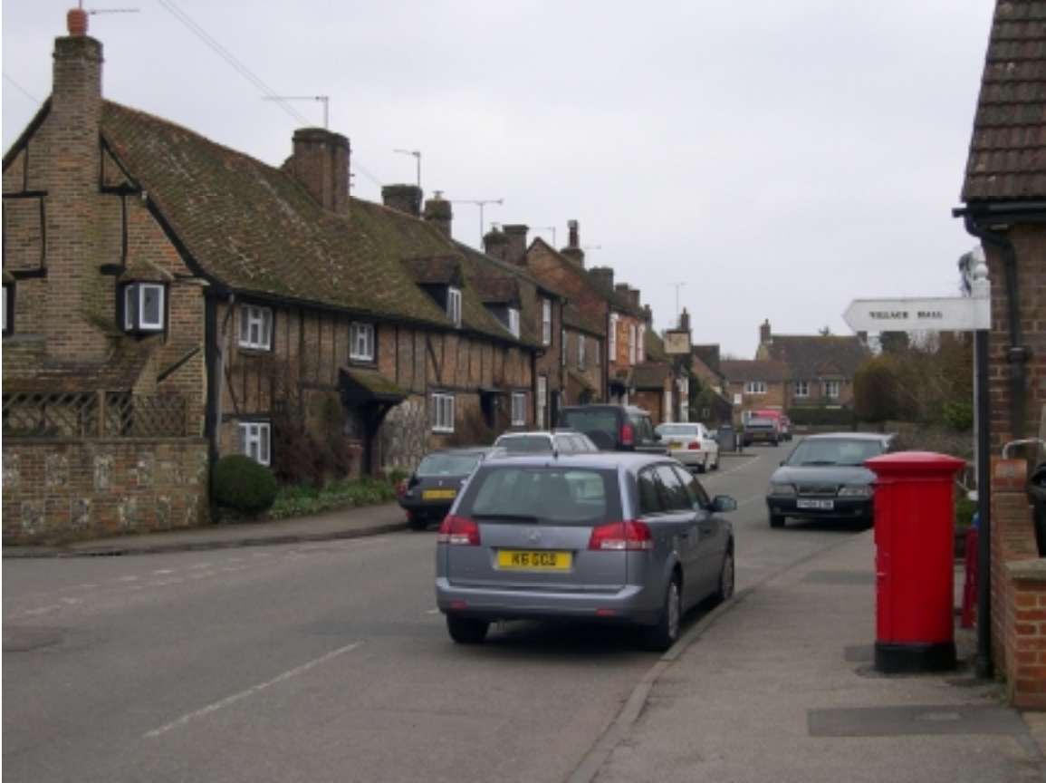
Figure 9: High Street, Flamstead