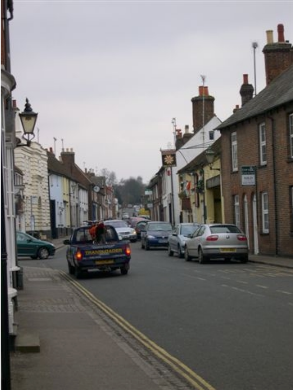
Figure 5: High Street, Markyate