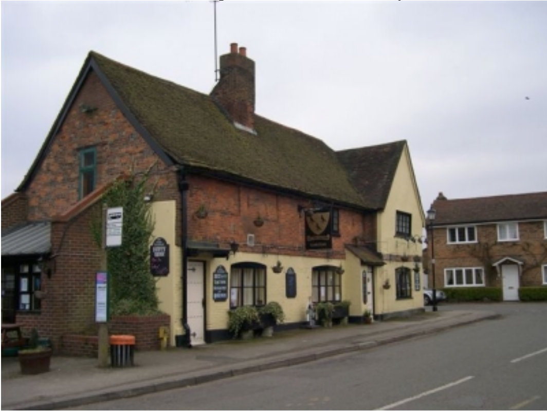
Figure 7: Three Blackbirds Pub, Flamstead

There are still several old buildings in Flamstead, as seen by these views: