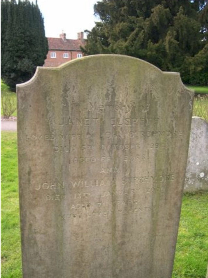
Figure 14: Inscription, looking West